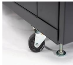
Heavy duty castor wheels with adjustable feet