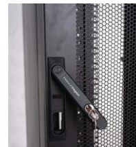
Robust swing handle lock set